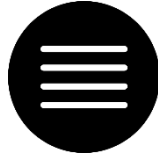
Preaching the Gospel