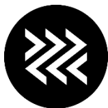
Dealing With Your Past

Being with Jesus promises transformation. It’s part of the Good News that when we have life with God we experience newness – a life where God is intimately involved in our lives to form us into people of love; just like Jesus was. Is change possible? The answer is: yes, and there are practices to help you along the way like: