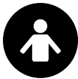
Silence + Solitude

To experience the life of Jesus, we must adopt the lifestyle of Jesus. Jesus’ lifestyle included regular practices which all contribute to life with God. You’ve heard of the phrase “practice makes perfect”. Athletes who make it to the Olympics practice, a lot. It’s no surprise when they win gold medals, they’ve earned it. In our aim of Christ-likeness we must practice the things that will ‘get us there ’.