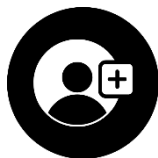
Identity + Destiny