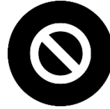
Peacemaking + Justice